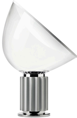
Table lamp providing indirect and reflected light. Reflector in painted aluminium, gloss white on the outside and matt white on the inside. Directionable diffuser in transparent PMMA. Body in matt black or naturally anodized extruded aluminium. Base in nickel-plated metal. Electric cable of useful length 220 cm, with dimmer switch for ON/OFF and adjustment of the light flow between 10-100%. Plug-in power supply with interchangeable plugs.

by Achille & Pier Giacomo Castiglioni , 1962